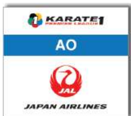
*Official Coach AO Box

Only coaches in possession of the “WKF Accredited Coach” level has access to the “WKF Kumite or Kata certification”